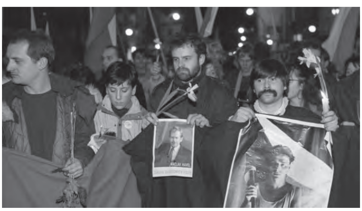
Source B: From an article in The New York Times , 27 November 1989.

Millions of Czechs and Slovaks stopped work and walked into the streets at midday today, bringing Prague and the rest of the country to a standstill. It was a powerful demonstration of national solidarity in support of free elections and in opposition to Communist domination. This carefully organized and non-violent general strike, which lasted from noon to 2 p.m., seemed a stunning criticism of Communist rule in Czechoslovakia.