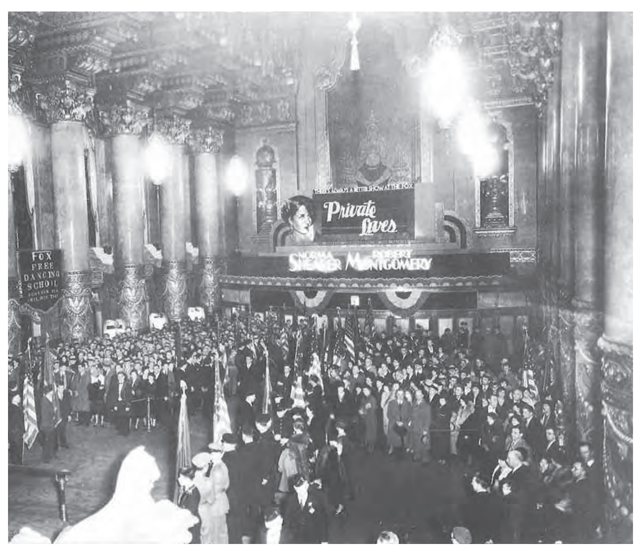
Source B: From an article about Jazz in a US magazine published in 1921, with the title Does Jazz Put the Sin in Syncopation?

Jazz has become very popular in this country. It has been used by barbaric people to stimulate brutality. Scientists have also shown that Jazz has a demoralising effect on the human brain. It stimulates the most extreme reactions, is harmful and dangerous and its influence is totally bad.